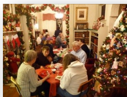
NWCHS members and friends at the 2016 Potluck

house are nods to traditions and memories. We even have a 'Legend of the Christmas Spider' tree!