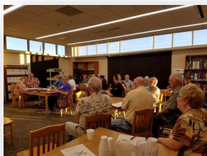
First meeting for the MAGG in their new room.