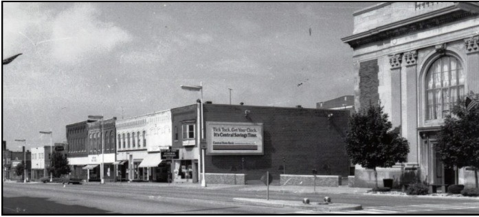
West 300 Block looking South

The Malsin Style Shop was at 328 S. Central Ave. It was located in the block that had one of the oldest banks in Marshfield—Central State Bank, which later became the M&I Bank. Central State Bank/M&I Bank and all the other buildings in that block were demolished to make room for a new bank and huge parking lot that now makes up 3rd and Central.