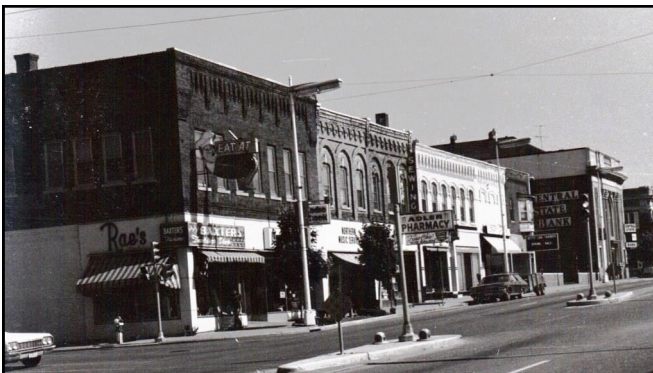
West 300 Block looking North