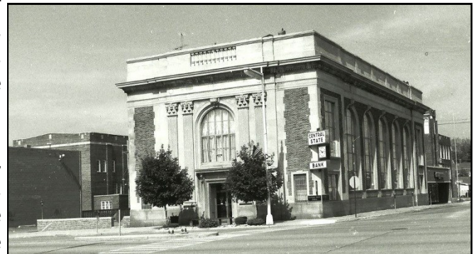
Central State Bank