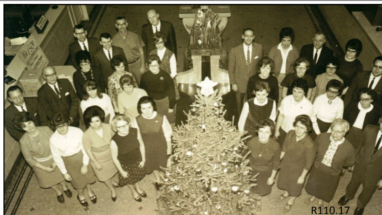
Christmas 1966—Interior of Central State Bank

Pg 5— 2015 List of artifact & archival donations