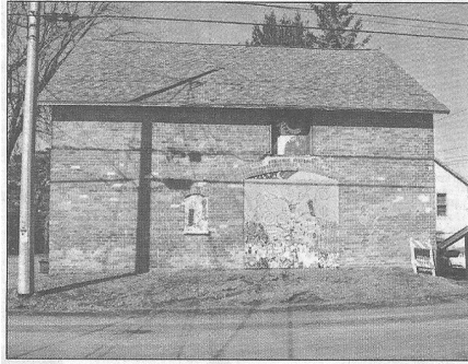
This barn housed a cow at one time.