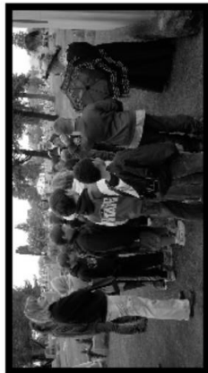
Stories of yesterday shared with school children

9:30 am - noon "Beginning Genealogy" Marshfield Public Library 211 E. Second Street Join us for a free beginner's workshop. A brief introduction gets you started. Then one-on-one help with an experienced family history researcher guides you to the best sources for your search. Please register in advance by calling the library at 715-387-8494 extension 211.