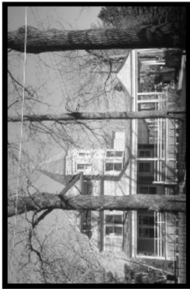
I.P. Hume House built in 1892 407 Park Street

5:30 - 7:00 pm Artist Reception - Refreshments will be served.