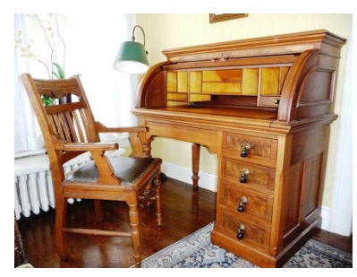
Circa late 1800s