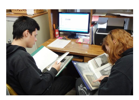
"Volunteering at Upham Mansion is a fun and great experience. You learn so many things about how Marshfield was back in the day, and it's interesting to see what's still here today."