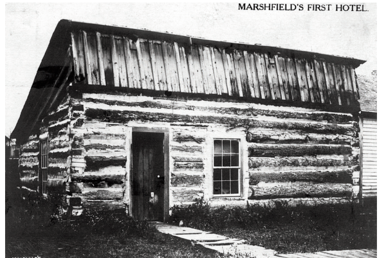
Marshfield's first hotel. (circa 1872)