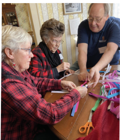
During the Sunday Open House the Folded German Star class needed a few extra hands.