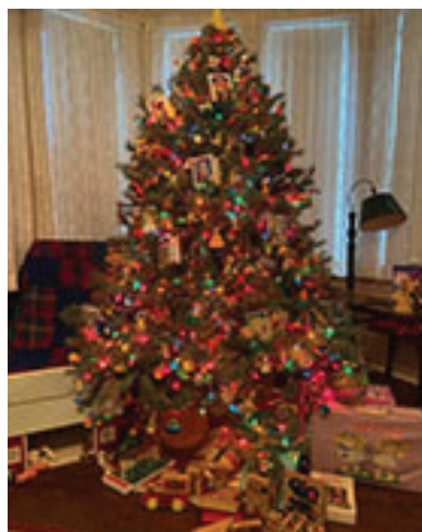
The 1990s Christmas tree in the library at the Open House.