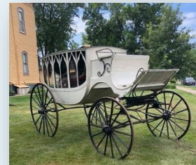
Above: 1860s Hearse Below: 1887 Mfld Fire Hose