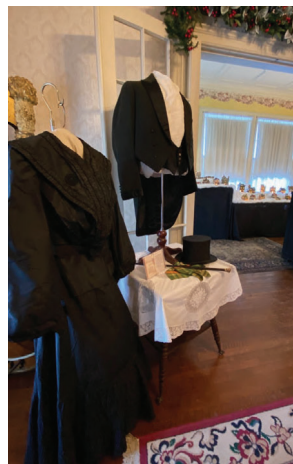
Clothing with a Dickensian influence in the parlor and the ceramic village in the sun room.