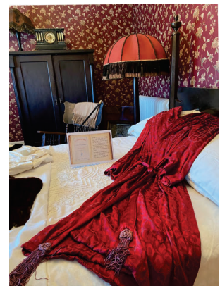
Scrooge’s bedchamber — the mantle clock was set to a couple minutes before one o’clock, when Marley said his first visitation would arrive.