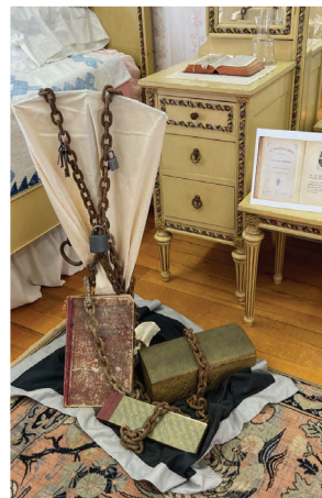
This vignette confused guests if they did not read the corresponding quote about Marley’s ghost!