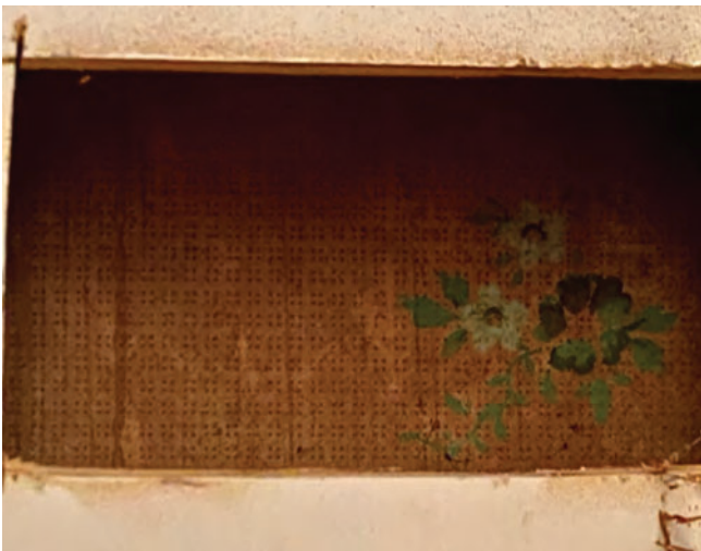
(2) Wallpaper found behind library shelves.