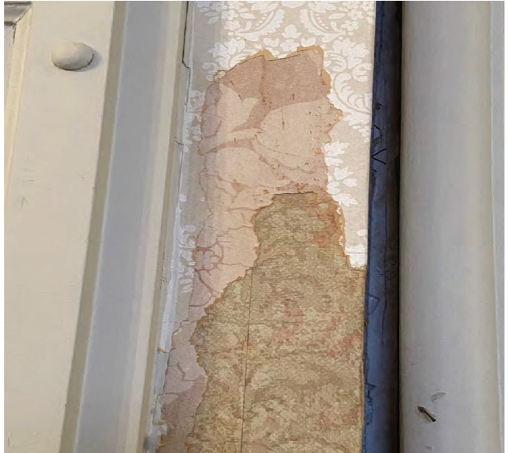
(3) Bottom layer reveals wallpaper from late 1890-early 1900. Middle layer is from mid 1920s.