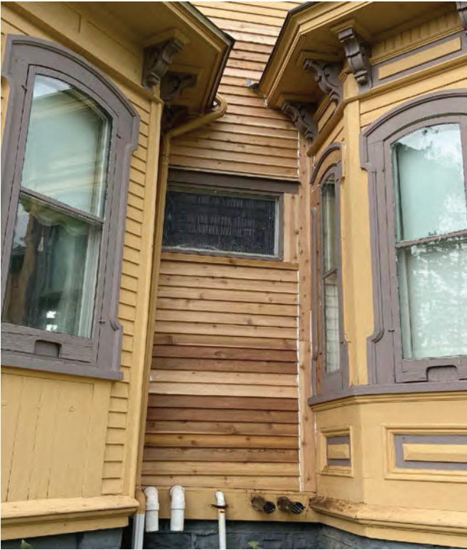
(1) Exterior East Wall where the bees were found.

(1) This past summer the outside east wall was repaired from bee damage. (2) This winter, as the house is undergoing interior repairs we are making discoveries. (3) While excavating layers of wallpaper in the parlor and library, we uncovered two earlier layers. We also found that we have sample rolls of these papers. The lowest layer dates to when the house was built! According to State Historic Preservation Officer, Daina Penkiunas, Ph.D., "...to convey the aesthetic preferred by the Uphams ...you are very fortunate to have surviving rolls to guide you...."