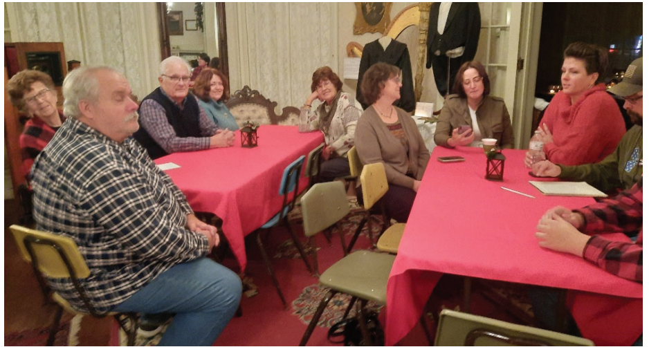
There was a great turn out for the annual holiday potluck