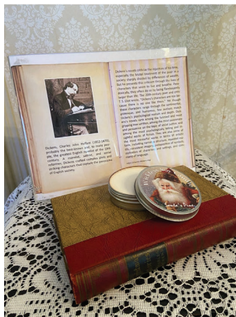
Charles Dickens’ A Christmas Carol

Other parts of the exhibit consisted of small vignettes based on “A Christmas Carol”. Visitors saw references to Tiny Tim and to Marley’s ghost. One room had tombstone rubbings from some of Marshfield’s past residents and a quote from Scrooge’s interaction with the Ghost of Christmas Future; another room was staged to look like Scrooge was getting ready for bed. We had fun putting the exhibit together and had great feedback from guests.