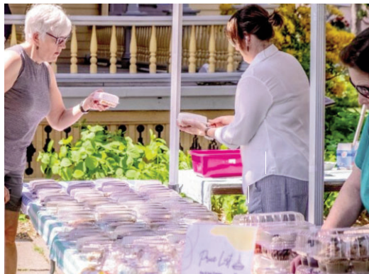
Visitors had many choices!