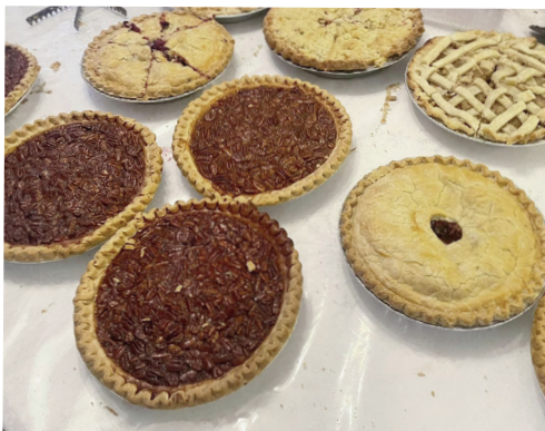
Many delicious pies were donated by individuals and businesses.