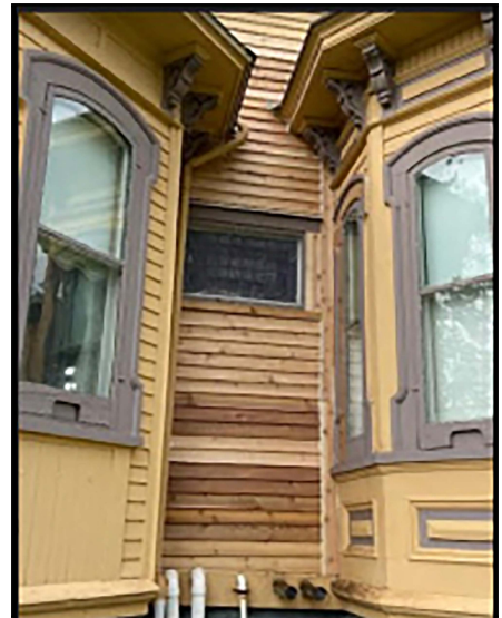
Fresh new cedar boards replace the old ones.