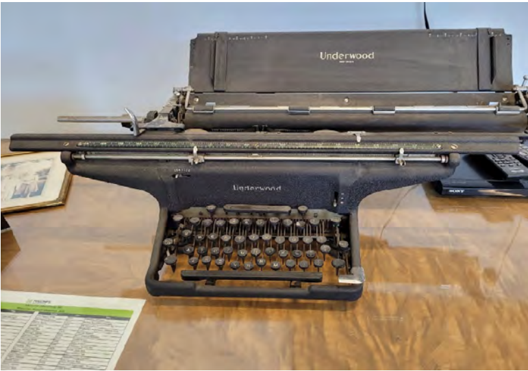
1935-1945 Underwood typewriter originally from the Roddis Lumber and Veneer Company in Marshfield.