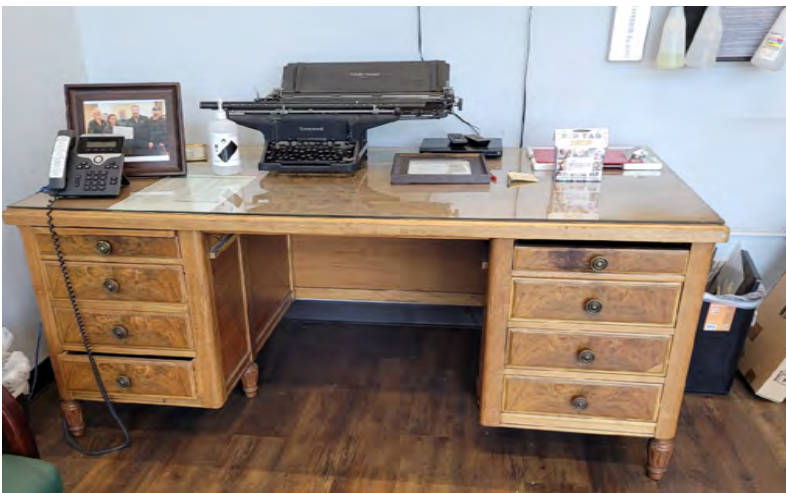
This desk originally located at the Roddis Lumber and Veneer Company, now sits in the Upham House office.