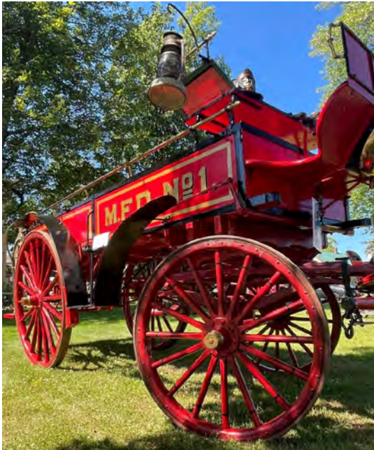
Marshfield's Fire Hose Cart #1—always a favorite! A huge thank you to Marshfield Fire & Rescue for allowing us to display it!