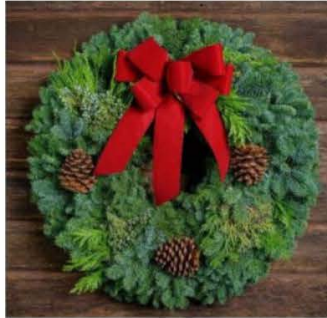
Example of a Wreath