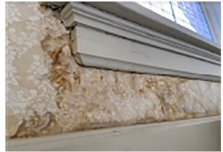
Water damage under one of the library windows.

The anticipated cost for all repair work could be close to $10,000. All donations and memorials will be much appreciated to help fund this project.