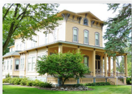
Preserving North Wood County history since 1952