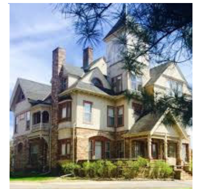
TB Scott Mansion